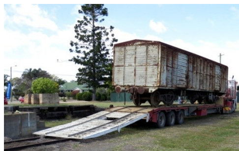
The first carriage, a wooden 1918 passenger car, came from Rockhampton followed by the steel freight carriage, which was transported from Gracemere