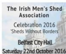
IMSA Celebration 2016

To read the full IMSO Newsletter ( http://menzshed.org.nz/wp-content/uploads/2016/07/IMSO-E-newsletter-vol-1-issue-1.pdf ).