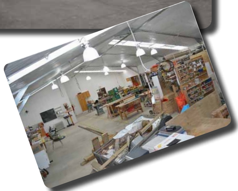
Right: The main workshop and storage facility on the North Shore.