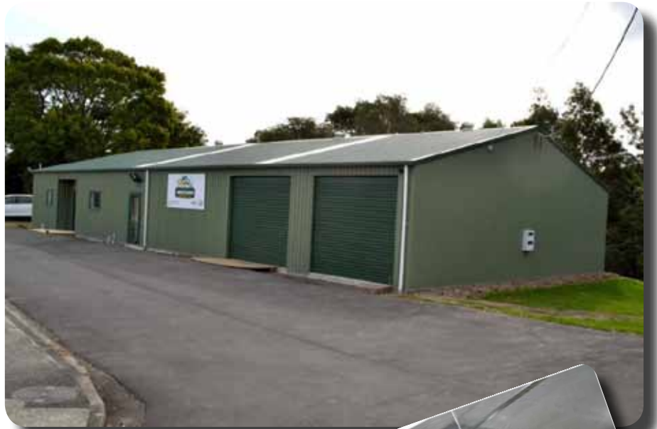
Above: The North Shore Shed - this end soon to be extended!