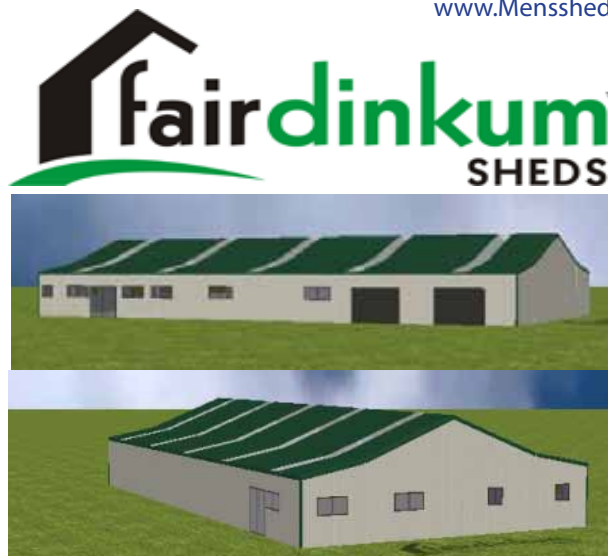
Left: A concept drawing from Fairdinkum Sheds.