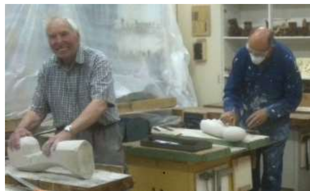
making for adults and school children ....

I have run three courses this last term and can supply plans for other sheds who may be interested in constructing the same) while other members have offered Santa's Elves "toys for Christmas" making sessions, while another member is currently running a Hebel (aerated concrete carving) course.