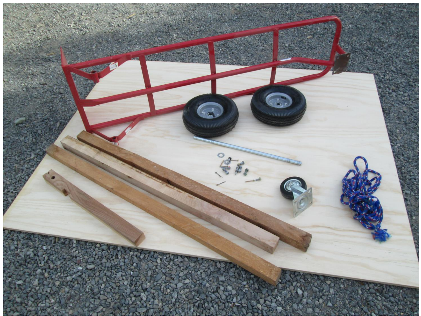
Prior to the activity weld on the mounting plate for the castor to the hand cart handle, and have plenty of odds n ends of timber to be used to join the plywood pieces