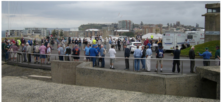
Early morning breakfast at Fort Scratchley, Newcastle

One of the strengths of men's sheds is how they bring together people of different backgrounds, experiences and skills and get them talking. This was true of the conference participants. No matter what their background and work experience, all were friendly and eager to find out where one is from, the shed size, number of members, activities and issues faced.