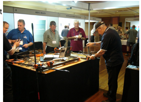
Chevington tools metal bending and riveting demonstration

There have been similar approaches made to sheds in NZ to participate in programmes or other activities. It is okay to say no.