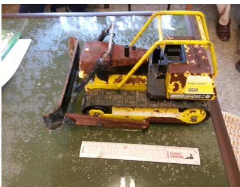
One of the Bulldozers as received.

We were asked to refurbish two Tonka toy bulldozers which were about 30 years old and had at one stage been buried. They were completely rusty and the bezels were ruined. Two of our members took them apart. Two days soaking the steel parts in vinegar loosened the rust and what was left of the paint. Everything was hand-sanded and a local panel beater very kindly remanufactured one piece that was beyond repair, he then filled and gave the parts several coats of matching Tonka paint. The bezels are unavailable for these models and one of our members designed them and we had them printed on adhesive vinyl. The finished toys were returned to the original family for two very happy grandsons.