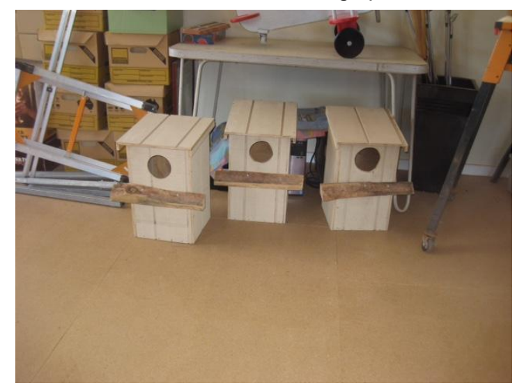
Our comment :- MAAATE YA JOKING

These boxes are built to encourage possum breeding and one was offered to us to bring back.