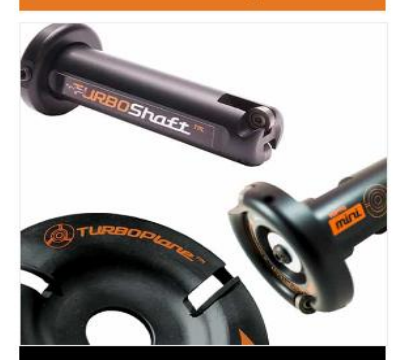
A range of revolutionary woodworking attachments ideal for freehand sculpting, planing and template work. These attachments fit on most standard 100mm or 115mm grinders.