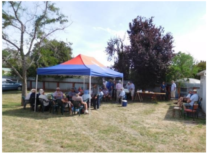
Photo is taken in the back yard of the courthouse section, plenty of room for expansion here.

Martinborough Mens Shed had a great BBQ to start off the New Year, which included a walk through the historic Courthouse which will become the Sheds new clubrooms for meetings, tutorials and spontaneous baking.