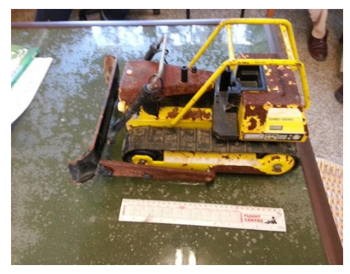
One of the Bulldozers as received.

We were asked to refurbish two Tonka toy bulldozers which were about 30 years old and had at one stage been buried. They were completely rusty and the bezels were ruined. Two of our members took them apart. Two days soaking the steel parts in vinegar loosened the rust and what was left of the paint. Everything was hand-sanded and a local panel beater very kindly remanufactured one piece that was beyond repair, he then filled and gave the parts several coats of matching Tonka paint. The bezels are unavailable for these models and one of our members designed them and we had them printed on adhesive vinyl. The finished toys were returned to the original family for two very happy grandsons.