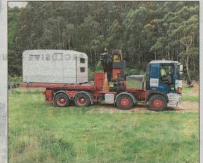
RELOCATED: The caravan being moved back to Whareroa Farm after being restored by Menzshed Kāpiti. PHOTO: KAP040518SPLCARAVAN