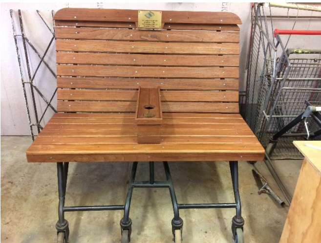
Shopping trolley love seat

One woodwork project has been very topical of late ... Our gents have been creating Bag Display boxes and Stands to support Sustainable Papakura and Beachlands with their Boomerang and Borrow & Return cloth bag policy for grocery shopping. They are trying to make a difference out there and alert more people to the fact that plastic bags are killing the wild life in our oceans. We support this wholeheartedly.