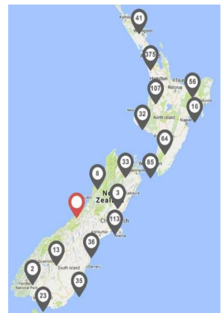
Map showing GPs offering a Portal

After signing in, you have the option of installing an app for your mobile phone or tablet.