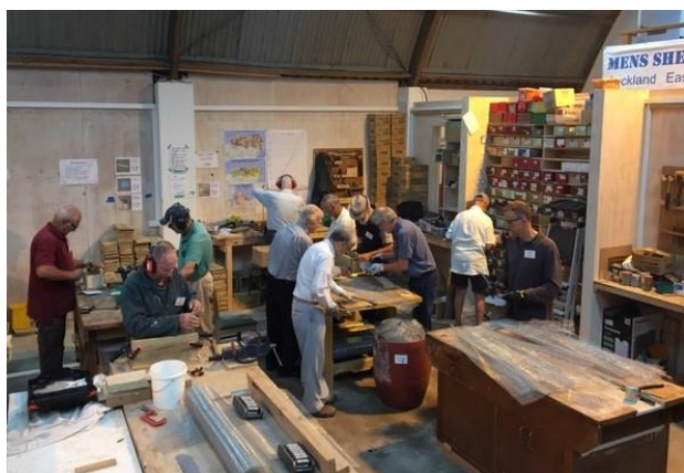
10 shed members busy on Rat Trap production.

An order for 600 rat traps from the Pest Free Howick group has been met with enthusiasm by members with the order well on the way to being filled.