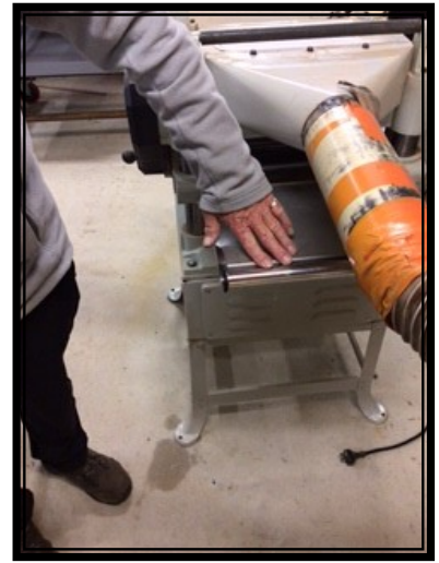
Table inserts in place You cannot fit your fingers in there any longer.