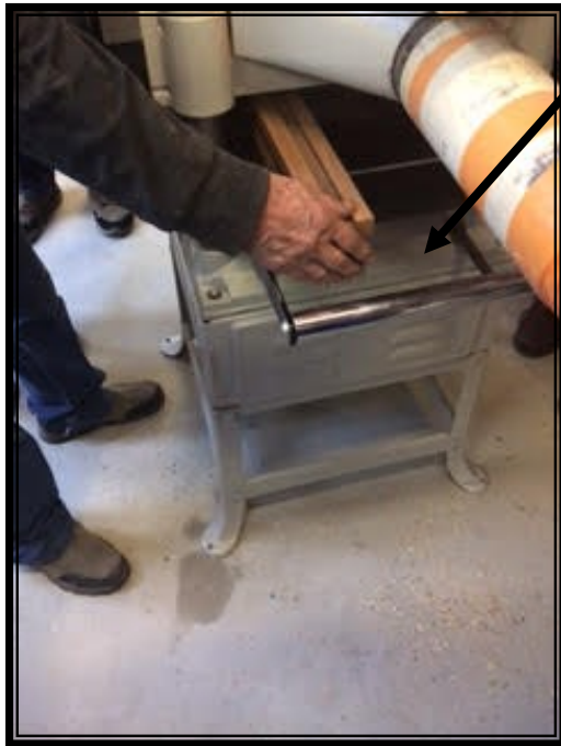
Gap between table and roller

Thanks to the Halswell Men's Shed for bringing this problem up. There is a gap between the in roller and the table and the out roller and the table on a thicknesser if using the extension rollers. Putting timber in is less of a problem of getting your hand caught between the in roller and table. The out table and roller are a different story. This has caused a member to have his hand caught between the out roller and the table and as the timber is fed through their hand became stuck between the timber and the roller. OH Dear! With a little thought they came up with a table insert that fits between the in or out rollers on both sides of the machine. This was made from stainless steel and stops anyone getting their hand caught while tailing out of the machine or putting timber through the thicknesser. It may be a good idea to look at your machines and make a similar plate up or a timber insert.